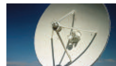
Media & Communications