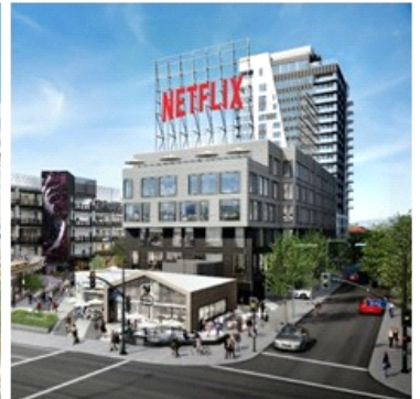
On Vine Mixed-Use Project (Los Angeles)